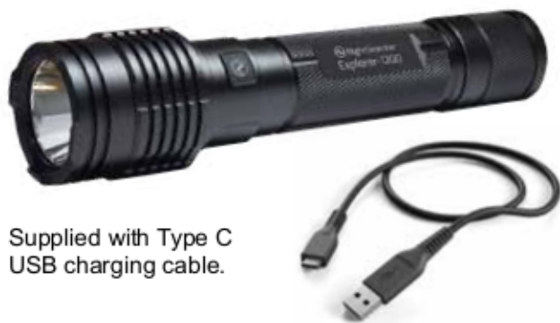
Supplied with Type C USB charging cable.