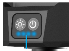
Battery Charging and Status Indicators